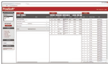
Jobs Batches Readings