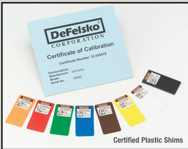
Certified Plastic Shims