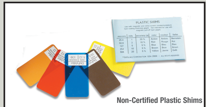
Non-Certified Plastic Shims

A package of 5 non-certified shims is included with all DeFelsko electronic coating thickness gages (Type 2).