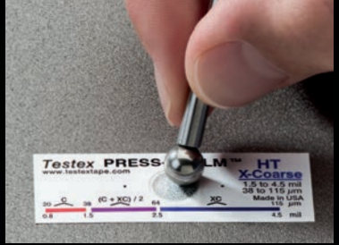
For use with Testex™ Press-O-Film™ Replica Tape

Measures and records surface profile parameters using replica tape