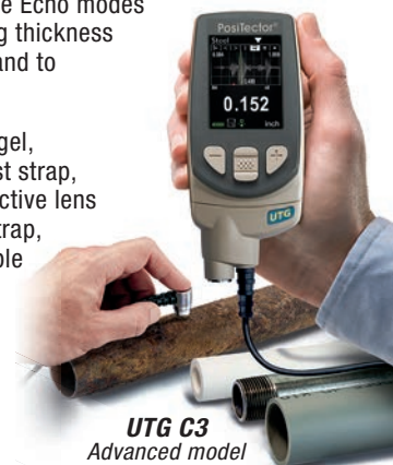
UTG C3 Advanced model with A-Scan

Weight: 140 g (4.9 oz.) without batteries Conforms to ASTM E797